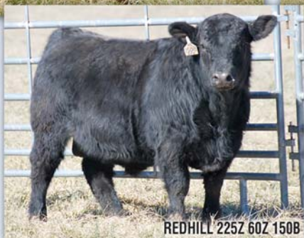
REDHILL 225Z 60Z 150B