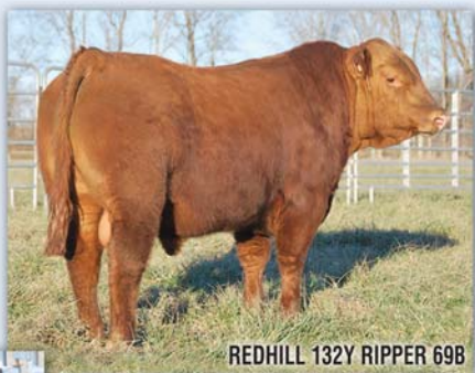
REDHILL 132Y RIPPER 69B