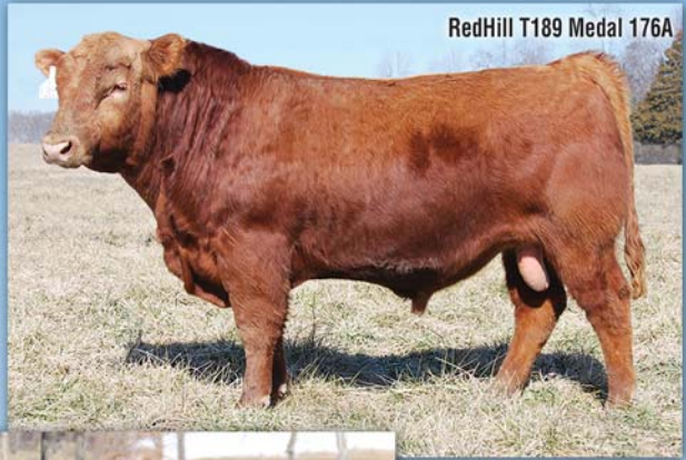
RedHill T189 Medal 176A