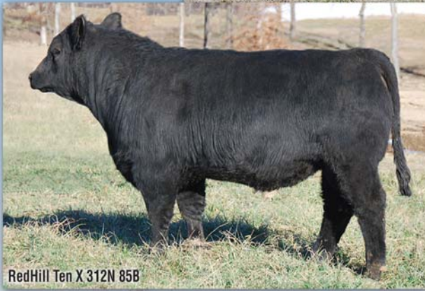
RedHill Ten X 312N 85B