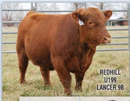
REDHILL U199 LANCER 9B